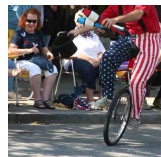
Saturday, July 4th saw Main Street lined to the MAX for this year's parade: "America and All That Jazz"